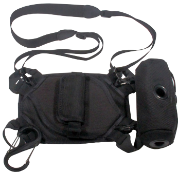
CARRY CASE Model 1008