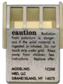
Replacement Cartridge for the 1C200 Model 1C200R