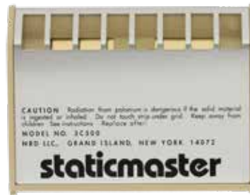
Replacement Cartridge for the 3C500 Model 3C500R