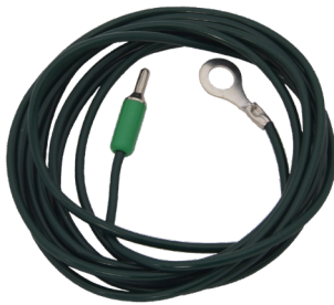
Ground Wire Model 5061