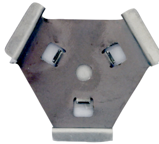
Mounting Clip Model MC2042